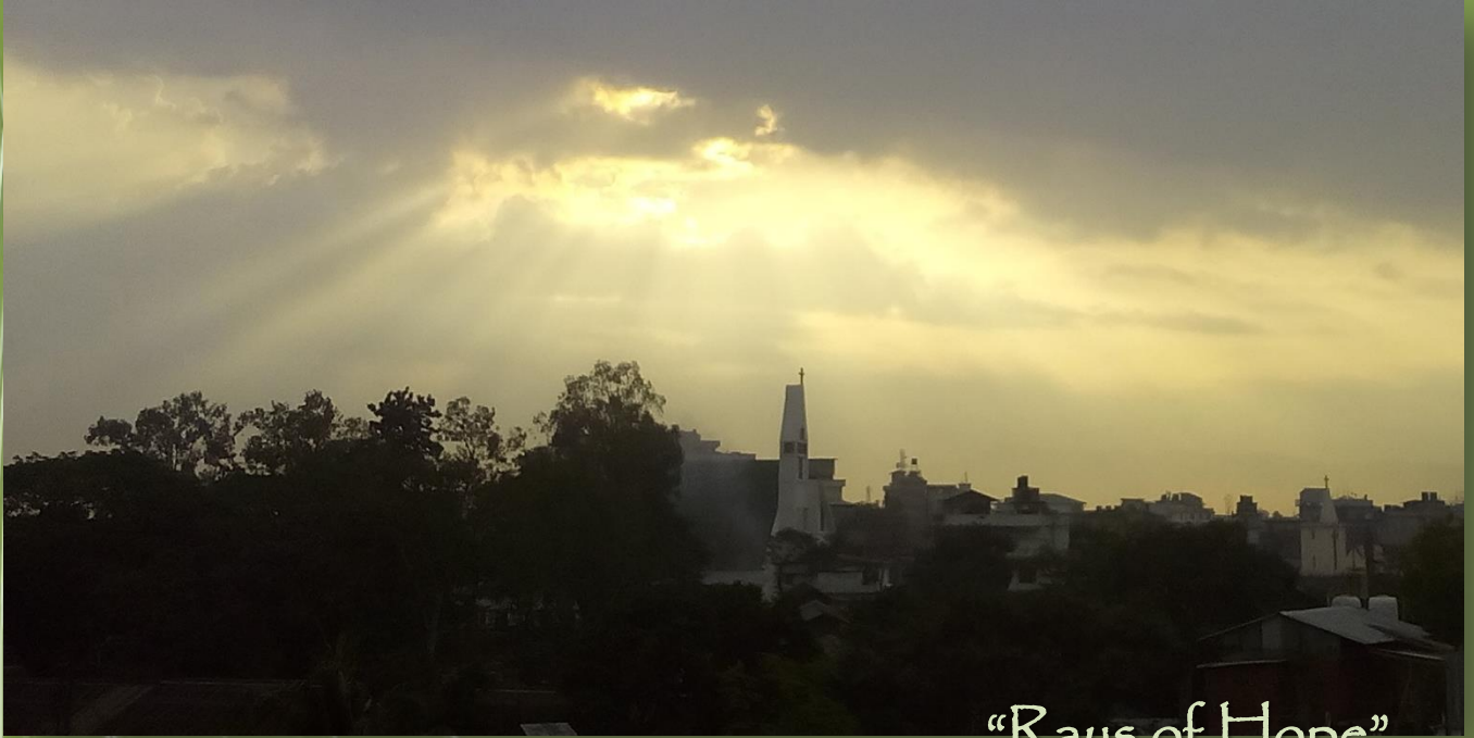
“Rays of Hope”